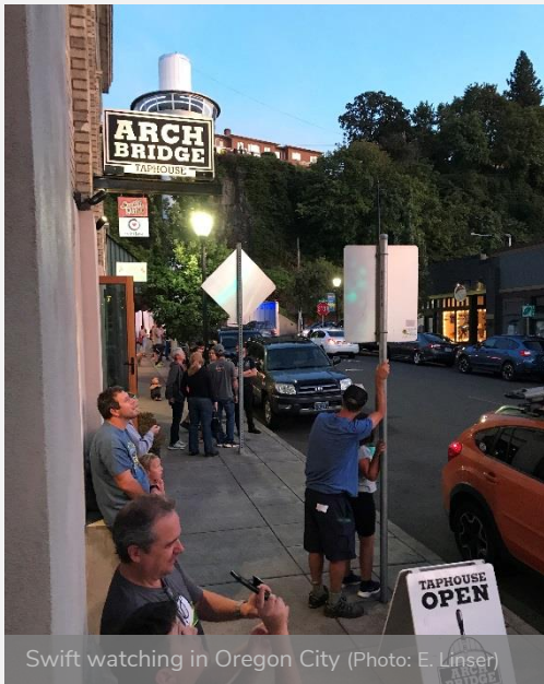
Swift watching in Oregon City