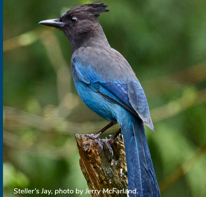
Steller's Jay