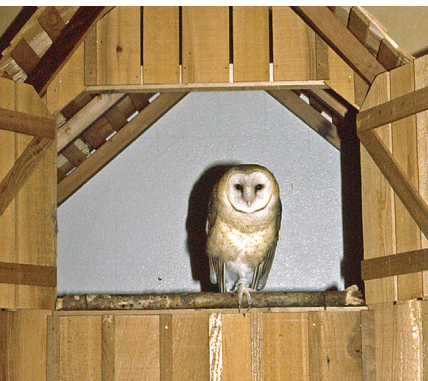
Owen the Barn Owl, the WCC's longest-term resident and first "education animal."

In its first year of existence, the new center accepted 372 animals for care and was run entirely by volunteers. The Care Center's longest-term resident, Owen the Barn Owl, arrived in 1978. Taken from her nest and raised by humans, Owen arrived far too imprinted to survive in the wild. She quickly took up residence on a perch above the refrigerator and became Portland Audubon's first education animal. Although she is more than twenty years gone, we still have people stop by today and tell us about meeting her as a child.