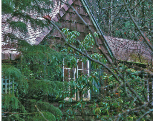
The Caretaker's Shack, which served as the Wildlife Care Center in the 1970s and early 1980s.

Over the past 35 years, the Care Center has become known not only for its lifesaving treatment of wild animals but also for its cutting-edge programs to promote wildlife stewardship and reduce wildlife hazards. Some of Portland Audubon's most innovative programs have emerged from the Wildlife Care Center. The animals we treat help inform the issues we prioritize, and their stories are often the most powerful catalysts for change. The Care Center birthed campaigns such as Cats Safe at Home, Bird-safe Buildings, Lights Out, Anti-Poaching, and Get the Lead Out, all of which address some of the biggest challenges wildlife face on our landscape. Every call, every intake is not only an opportunity to save a wild animal, it is an opportunity to reduce the hazards that bring these animals to us in the first place.