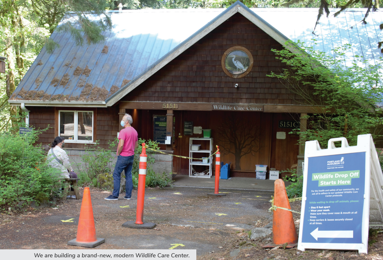
We are building a brand-new, modern Wildlife Care Center.

The Wildlife Care Center, Audubon House, the Nature Store, and the outdoor visitor experience are all in need of maintenance and improvement. That's why we have embarked on a capital campaign to raise vital funds for major upgrades to our facilities, ensuring we can continue to inspire people for generations to come.