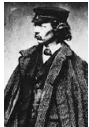
Frederick Law Olmsted, Sr.

Here in Portland, Olmsted admirers are assembling numerous lectures, events, and field excursions that will focus on the works of Frederick Law Olmsted, Sr. (FLO) and his son John Charles Olmsted, who carried forward the landscape philosophy established by Olmsted senior, including the public spaces of multiple cities in the Pacific Northwest.