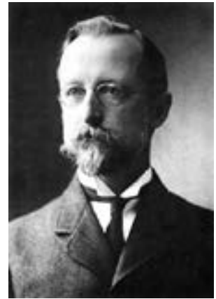
John Charles Olmsted