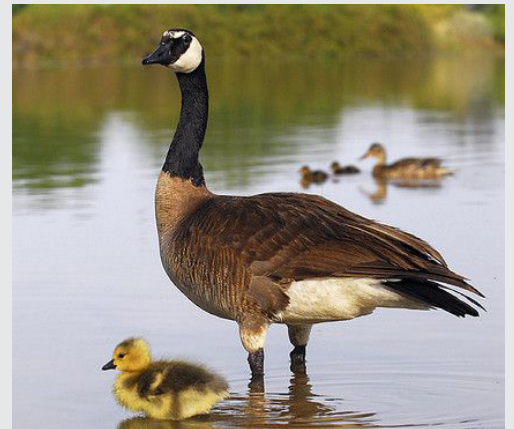
Canada Goose: yellow & gray, indistinct markings, large

Clackamas ODFW Office 17330 SE Evelyn Street Clackamas OR 97015 971-673-6000