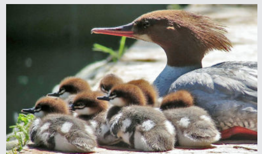
Mergansers & others: call or email the Wildlife Care Center to consult if the ducklings don't look like any of the three most common species