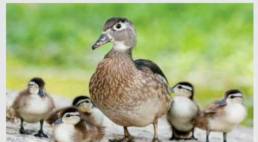
Wood Duck: whitish yellow & dark brown, eye line from back corner of eye to back of head only